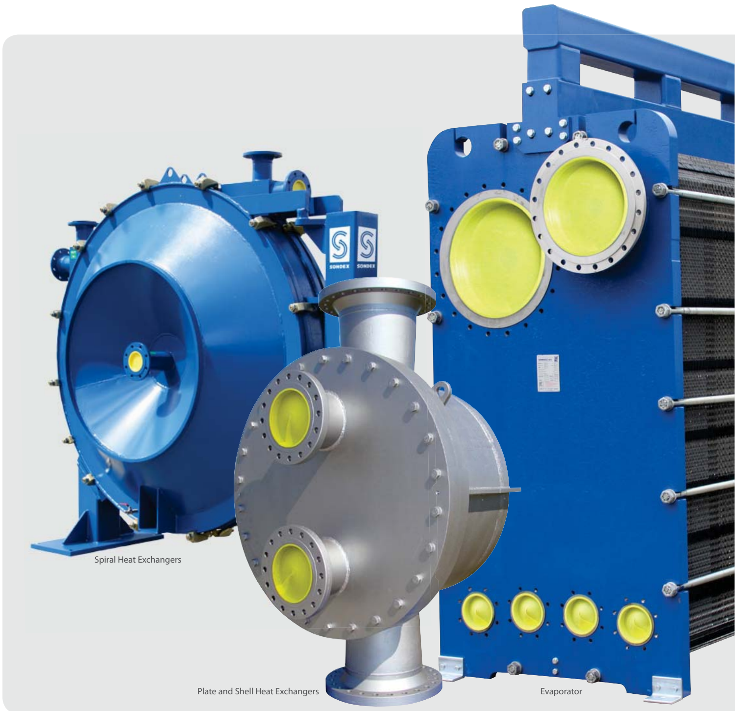
Spiral Heat Exchangers