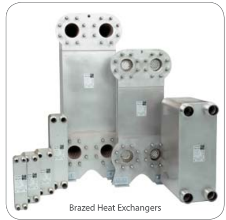
Brazed Heat Exchangers