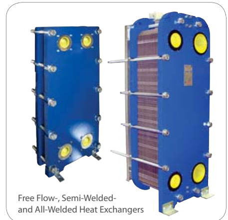
Free Flow-, Semi-Welded- and All-Welded Heat Exchangers